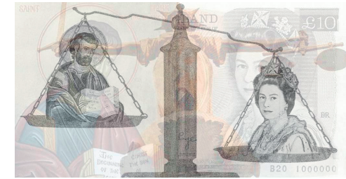
Reuben the Hood