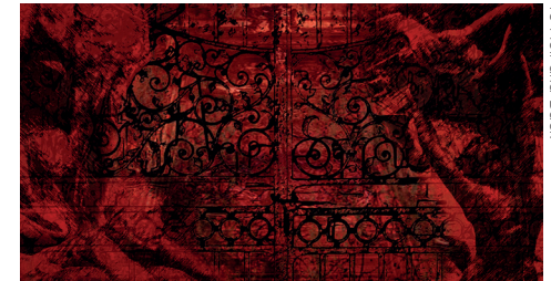
To Hell and Back